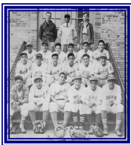
The 1946 Hammonton High School Varsity Base- ball Team.

Our Collection... includes a wide variety of materials related to our Mission. These items include, photographs, books, historic documents, artwork and artifacts. This pamphlet showcases just a sample of the photographic treasures you will discover in the museum.